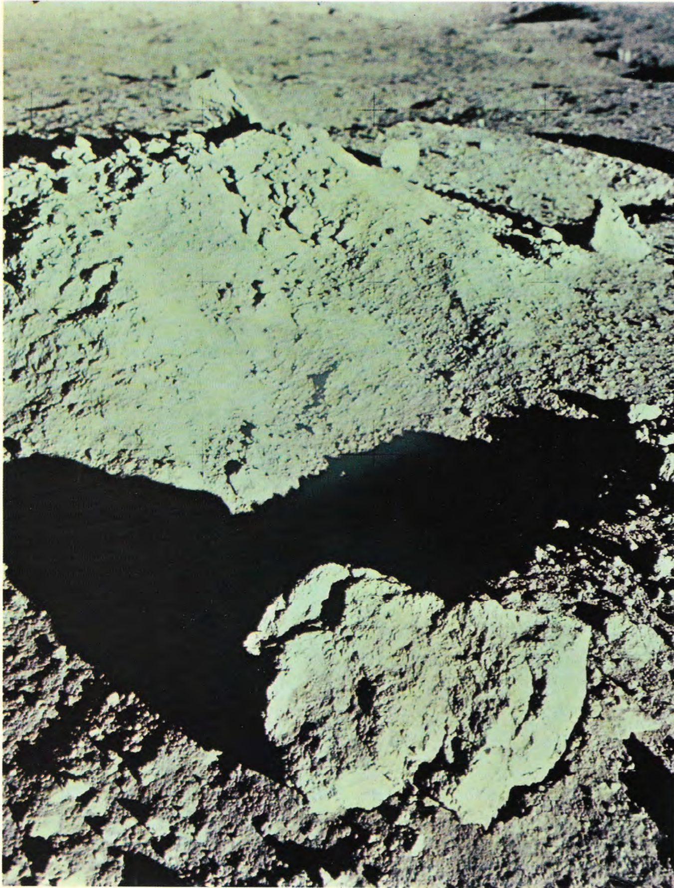
A ROCK LYING ON THE LUNAR SURFACE.