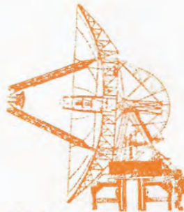
210 FOOT DISH ANTENNA

For 3-D Observance Of World Weather To Measure Temperature Levels Of Oceans And Atmosphere. Carries Heat Sensing Infrared Instruments To Scan Earth.