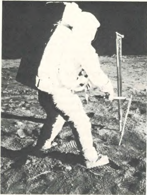
Astronaut Edwin Aldrin is in the process of taking a lunar soil sample. In the background is the solar wind experiment.

velocity had been cut to slightly over 2,000 mph. At this low point, the Apollo was approximately 34,000 nm from the moon, a zone where the pull of the moon's gravitational field is stronger than that of earth and the spacecraft, accordingly, began to pick up speed.