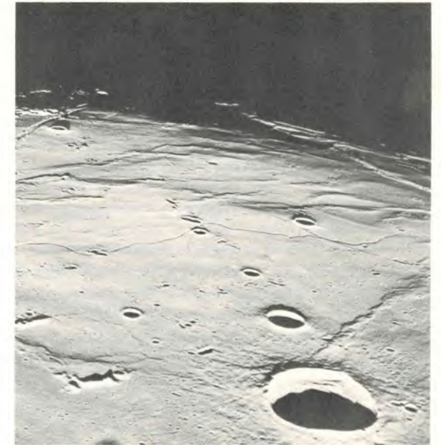
Approach to Landing Site #2 taken from lunar orbit. Crater Maskelyne at lower right. Shadow at lower left thrown by part of spacecraft.

Aldrin then took the solar wind experiment and set it up. This was a narrow rectangle, about 4 feet long, of a foil-like material suspended from a rod that extended horizontally from the top of an aluminum staff. Aldrin forced the staff far enough into the moon's surface so that it would stand alone. He adjusted the