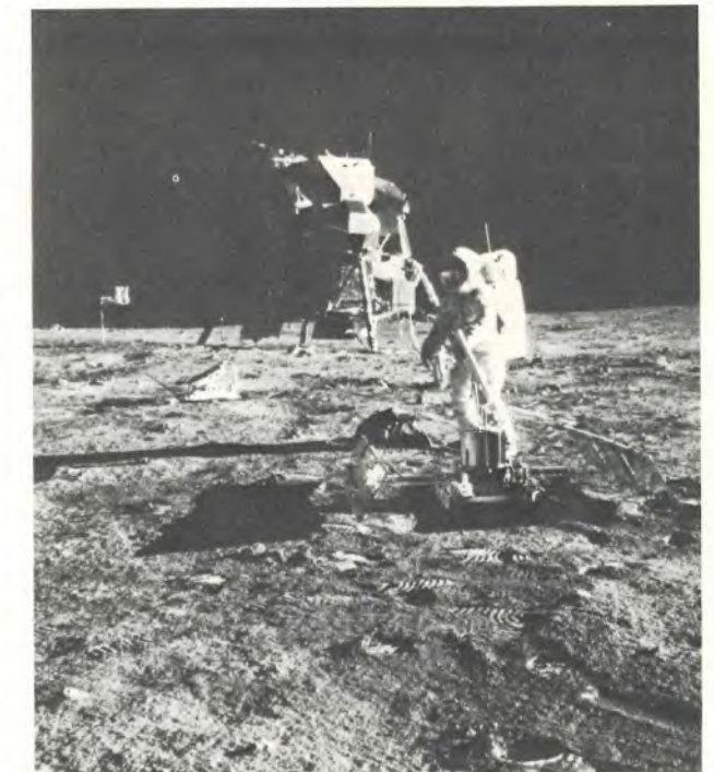
Aldrin prepares to deploy two experiments: the seismometer and the laser reflector.

Highlighted by full in situ coverage of the moon walk in black and white, the astronauts' telecasts began with an unscheduled transmission on the second day of the flight, followed by a second scheduled effort lasting more than a half-hour. At 4:40 P.M. EDT on the third