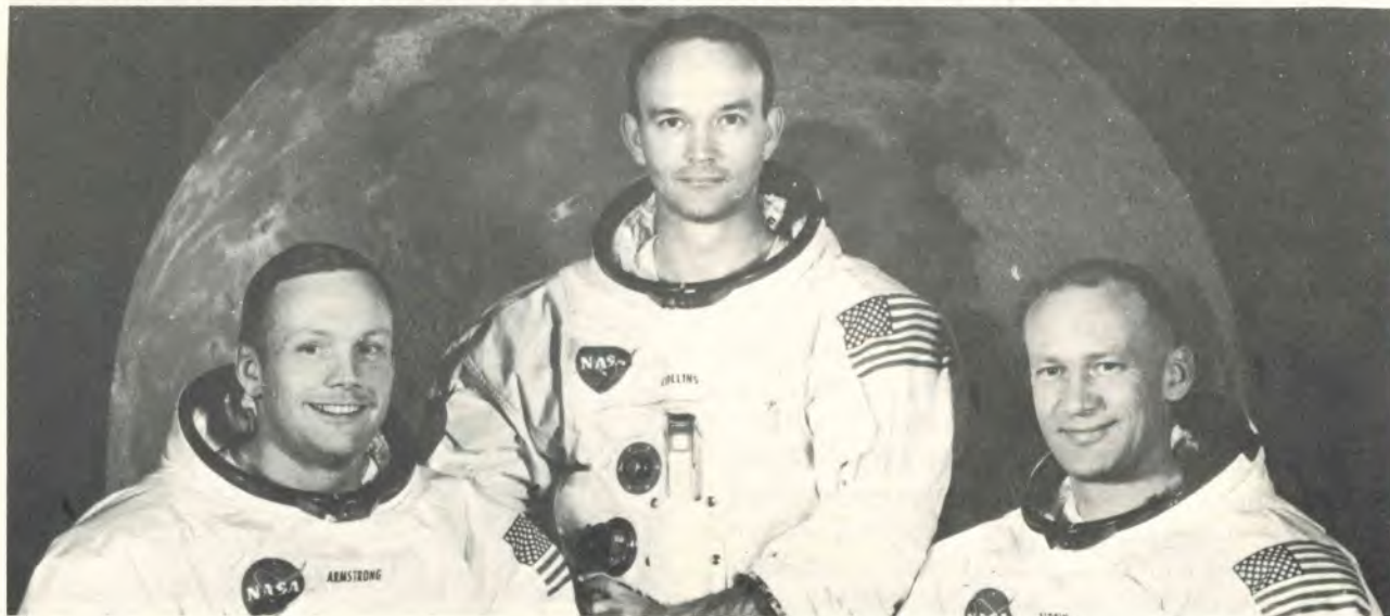
Astronaut Neil A. Armstrong, Commander for Apollo 11

Thus, in 195 hours, 18 minutes and 35 seconds, Apollo 11 and Astronauts Armstrong, Aldrin and Collins moved the world into a new era.