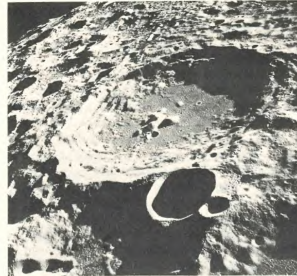
Oblique view of the lunar far side from lunar orbit. Large central crater is International Astronomical Union #308. It has a diameter of about 50 statute miles.

Besides the TV camera, the astronauts used a trio of other cameras for surface photography. They got both still and sequence coverage with a Hasselblad still camera, a Maurer data acquisition camera and the Apollo Lunar Surface Close-up camera.