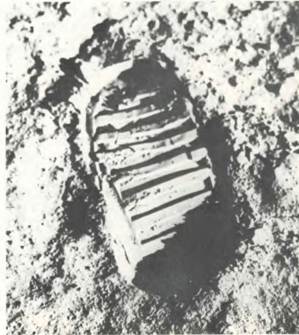
Astronaut footprint on the moon.

Once the LM inspection and the sample collection were completed, Aldrin got out of the LM and climbed down the ladder, with Armstrong providing voice guidance. Armstrong was taking pictures of the event at