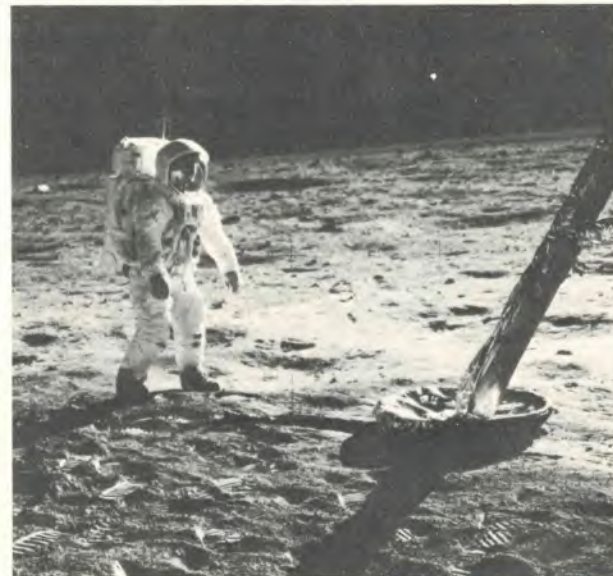
"Buzz" Aldrin walking in vicinity of Lunar Module. Footpad of Module is at right.

During the moon walk, the TV transmission had a ghostly quality. The astronauts' white space suits, the grey tones of the moon's surface, the buoyancy of their movements, and the strange configuration of "Eagle" combined to give the impression that what viewers were seeing was truly from another world.